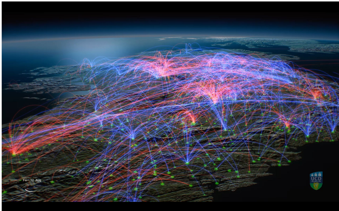
Fig. 1 Screenshot of an animation showing cattle movement events (for example, the movement of a trailer, which may contain a number of cattle) in Ireland. Red lines represent 'High Risk' moves, those where animals are traded between herds in Ireland (including trade via a market), as well as a small number of imports; blue lines represent 'Low Risk' - moves to slaughter or an export point. In this study, a movement from farm to market and subsequent onward movement to farm was counted as two movement events