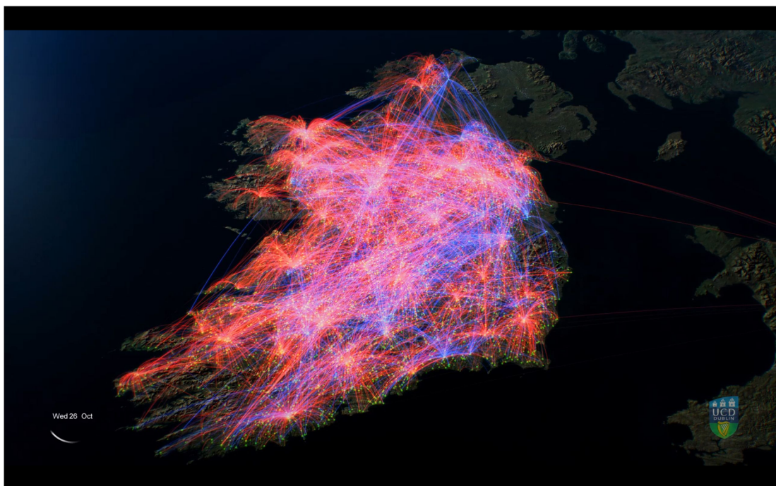
Fig. 2 Screenshot of an animation showing cattle movement events (for example, the movement of a trailer, which may contain a number of cattle) in Ireland. Red lines represent 'High Risk' moves, those where animals are traded between herds in Ireland (including trade via a market), as well as a small number of imports; blue lines represent 'Low Risk' - moves to slaughter or an export point. In this study, a movement from farm to market and subsequent onward movement to farm was counted as two movement events