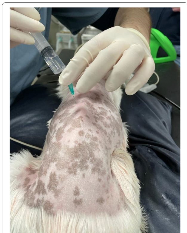
Fig. 2 Photographic view of a T13 left-sided retrolaminar injection, performed in Case 1. The puncture site is located approximately 1 cm lateral to the midline at the level of the spinous process of T13. The 21G, 1.4-inch hypodermic needle should be advanced at a 45° angle to the skin, in a caudoventral direction through the epaxial muscles until contact with the lamina is achieved and should remain in a strict parasagittal plane to avoid risk of inadvertent pleural (further lateral from the spinous process) or epidural injection (further medial to the spinous process). After contact with the lamina is achieved, the syringe is attached to the needle and bupivacaine is injected once negative blood aspiration is confirmed

period. The dogs were monitored closely postoperatively and were moved back to the surgical ward once fully recovered. Postoperative pain was assessed using the short form of Glasgow Composite Measure Pain Scale (GCMPS-SF) for dogs every four hours for the duration of the hospitalization. All dogs were discharged to their owners after 2–11 days depending on their disease progression and ambulatory ability.