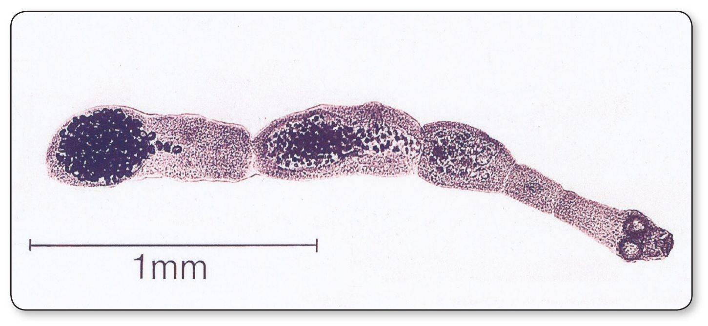
Figure 1: Adult E.multilocularis.

protoscoleces are produced. The cysts vary in size, shape and number and aggregate to form alveolar structures Imm to 30mm in diameter, containing a variable number of protoscoleces that have the capacity to proliferate and progressively invade the surrounding host tissue. During this process the parasite is protected from the host immune response by its carbohydrate-rich laminated layer. Metacestode development is well adapted to the naturally short-lived intermediate hosts and protoscoleces are produced in 40 to 45 days. In experimental models natural intermediate hosts will die from the consequences of parasitic organ infiltration about five months following infection. However, in the wild the host might succumb to predation by a carnivore before this occurs.