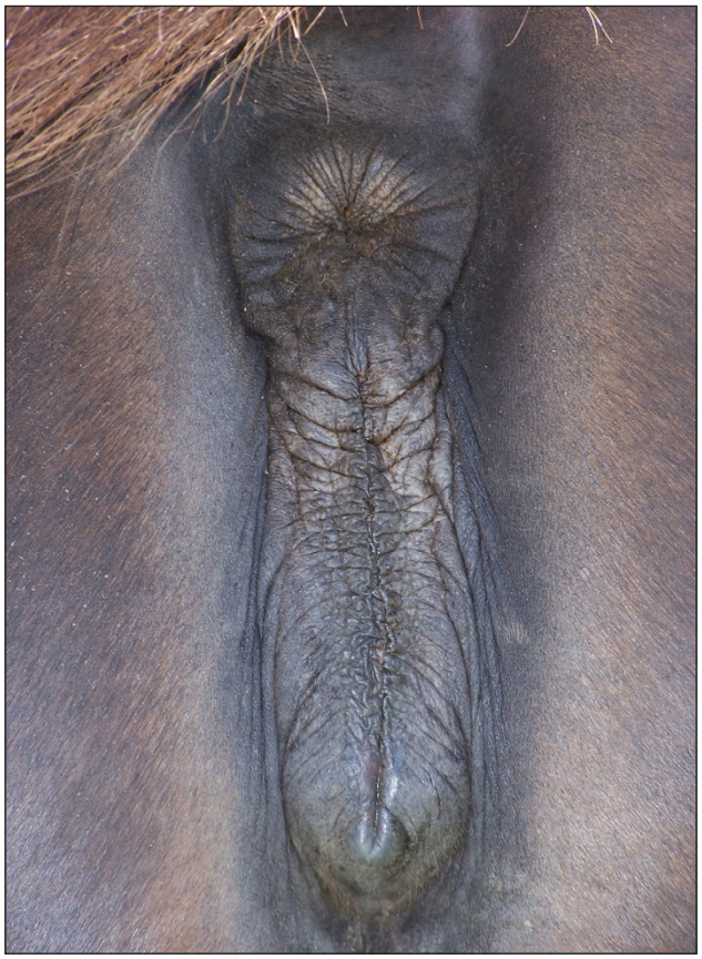
Figure 1a: A healthy vulva. The labiae of the vulva are symmetrical and the vulva itself is properly closed.