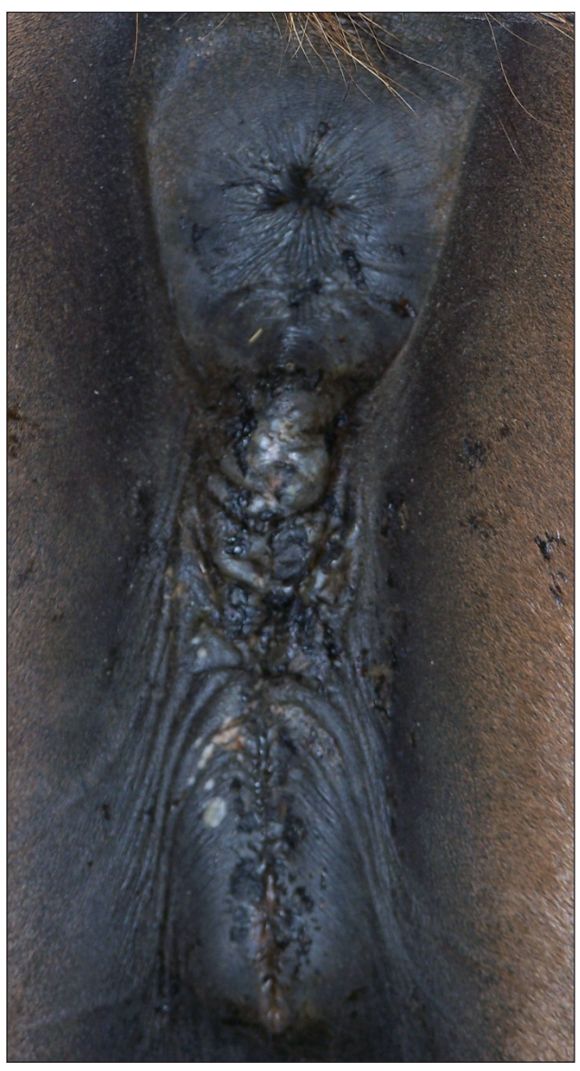
Figure 1b: Altered conformation of the vulva. The labiae do not create a proper seal and the rectum is displaced cranially, allowing the vulva to be pulled dorsal to the ischiatic arch, causing constant faecal contamination of the vulva and vestibule.

per second and help to transport mucus, fluid, bacteria and other debris along the longitudinal folds of the endometrium and the cervix (Causey, 2007). However, dilated capillary spaces between the folds and damaged, scarred or atrophic folds disturb this precise clearance mechanism (Causey, 2007). Ulceration, degeneration and lack of cilia are suggested to have the same effect (Causey, 2007).