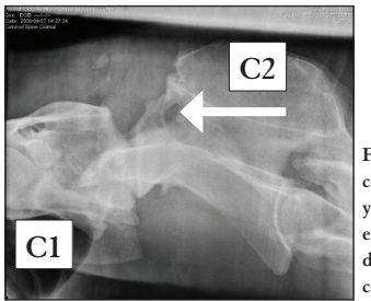
Figure 2: Lateral view of the cranial cervical vertebrae (C1-C2) of a nineyear-old Thoroughbred racehorse eight months after the fracture was first diagnosed. The odontoid fracture is completely fused (white arrow).

that the horse had improved dramatically. The neck pain and abnormal head and neck posture had disappeared completely within the weeks following the visit to UCD. Radiographs taken eight months after the initial diagnosis showed the satisfactorily reduction and alignment of the odontoid process fracture ( Figure 2 ).