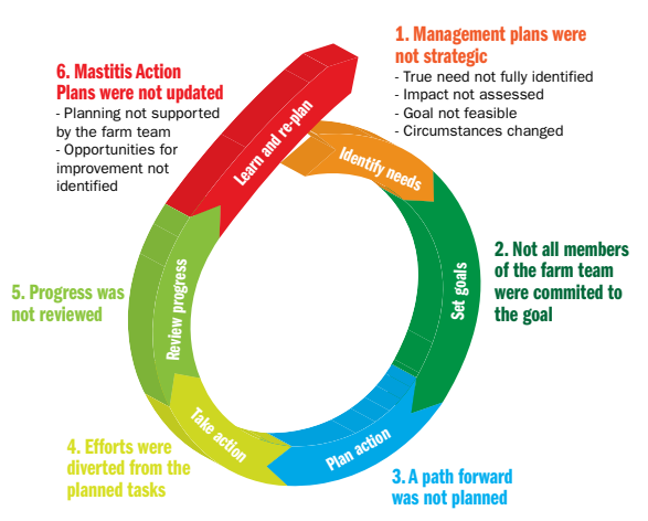
Figure 3: Stalling points, and potential reasons for stalling, on the action planning cycle (Nettle et al. 2006).