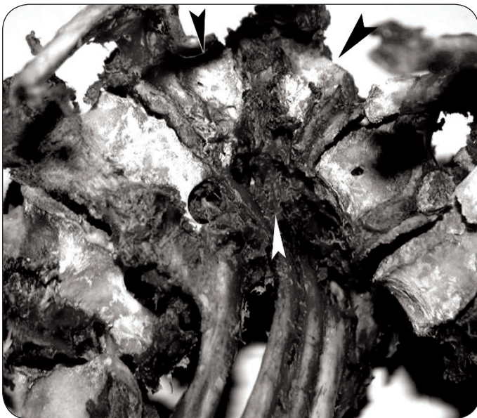
Figure 2: The photographic view of the multiple hemivertebrae (white arrow) with one-sided fused vertebral bodies (black arrow head) in Case 3.