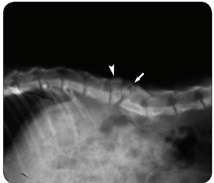
Figure 3: The radiographic view of Type 1 (L3, arrow) and Type 2 (L2, arrow head) hemivertebrae according to the Nasca classification (Case 4).