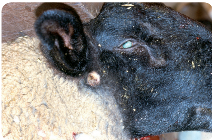
Figure 1: Corynebacterium pseudotuberculosis abscessation in parotid lymph node.

All sheep were necropsied using a standard protocol. An external examination of the carcass was carried out, noting any sinus discharges or subcutaneous swellings. The superficial and visceral lymph nodes, lungs and liver were then examined for abscessation. Suspect lesions were cultured for C. pseudotuberculosis (Cowan and Steel, 1974).