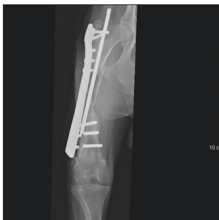
Figure 1: Craniocaudal radiograph of the right femur demonstrating fracture of the most distal two bone screws, intramedullary pin proximal migration and radiolucency surrounding the intramedullary pin and several screws (5th, 7th & 8th). There is an absence of mineralised callus. The changes are consistent with a biologically inactive femoral nonunion fracture, implant failure and suspected osteomyelitis.

Physical examination eight months after first presentation revealed marked right pelvic limb muscle atrophy. A purulent, discharging sinus was present in the proximal half of the surgical scar. Pain and instability was apparent on palpation of the femur over the fracture site. The intramedullary pin was palpable proximal to the trochanteric fossa, suggesting pin migration. Haematological and biochemical profiles were obtained and found to be within normal limits. The dog was sedated with a mixture of 10 µg/kg medetomidine and 0.2 mg/kg butorphanol administered intramuscularly. Orthogonal radiographs of the right femur were obtained. The radiographs revealed a number of abnormalities. Two of the three distal bone plate screws had fractured, the intramedullary pin had migrated proximally and there was lysis around the intramedullary pin and several bone screws. Very significantly, there was an absence of mineralised callus at the fracture site. The radiographic changes were consistent with a biologically inactive femoral nonunion fracture, implant failure and were highly suspicious of osteomyelitis ( Figure 1 )