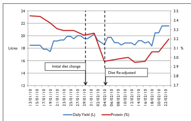
Figure 2 - Average milk yield per cow per day and bulk tank milk protein percentage changes following dietary alterations on an Irish dairy farm.

The agreed recommendations were implemented on January 30. Over the next five days the farmer observed reduced yields in early and late lactation groups. The average reduction was approximately 0.9L per cow per day (Figure 2). The milk composition was adversely affected over the same period with protein percentage in the bulk-tank reducing from 3.24% on January 29 to 2.96% on February 4 (Figure 2).