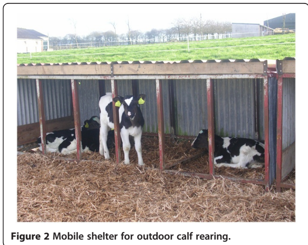
Figure 2 Mobile shelter for outdoor calf rearing.

Daily health parameters such as calf diarrhoea, group diarrhoea (entire pen showing clinical signs of diarrhoea), pneumonia and deaths were recorded up to day 80. Individual calf LW was recorded at the start day (day 10) and weekly thereafter until day 80 using a mobile weighing scales (Tru-test Ltd, Auckland, New Zealand). Animal LW results are presented fortnightly. In addition, maiden heifers were weighed on one occasion prior to start of the breeding season and individual