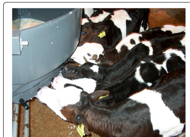
Figure 1 Calf milk feeding using a mobile teat feeder.

Experiments 1 and 2 were conducted in years 2007 and 2008, respectively, with a number of common calf rearing procedures used for both experiments. Calves on each treatment were penned in groups of nine and each treatment group was replicated. Group pens were filled before calves were assigned to the next treatment group. This method was used to assure equal age profile within pens and to maintain a stable number of calves within each pen. This method also facilitated weaning steps. All calves were fed twice daily with colostrum for 3 days and then whole milk until day 10. Calf feeding times were 0900 h for OD calves and calves fed TD were offered their second feed at 1530 h. Whole milk was collected daily, during milking for calf feeding, after plate cooling (milk temperature ranged from 10°C to 15°C). All calves were fed using mobile teat feeders (not individually sub-divided) suspended on the gate of each pen or paddock (Figure 1). After each feeding occasion milk teat feeders were removed and washed with running water. Calves, offered WM twice daily, received 2.25 liters of milk at each feeding time. Calves offered WM once daily received 4.5 liters of milk at the morning feeding time. Electrolytes were added to water and offered to calves where calf diarrhoea was diagnosed. Calves