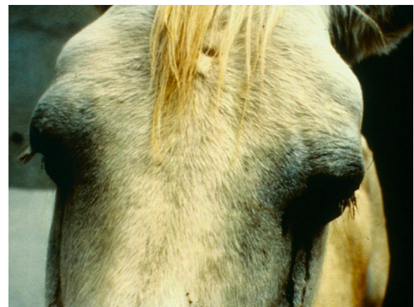
Figure 3 Horse exhibiting oedema of the supraorbital fossae.

The principal vector of AHSV is the female midge of the genus Culicoides (Diptera: Ceratopogonidae). These insects are important vectors of a number of viral diseases worldwide including: Akabane, Bovine ephemeral fever, Bluetongue, Epizootic haemorrhagic disease, Equine encephalosis, Oropouche, and The Palyams [1,35]. It was first discovered that adult females from the genus Culicoides were the principal vector for AHSV in 1944 [36]. Today there are approximately 1,340 recognised species of Culicoides worldwide, of which 96% are obligate bloodsuckers [37]. Typically, Culicoides spp. measure between 1–3 mm, making them amongst the smallest haematophagous flies in the world, and they are currently found on all