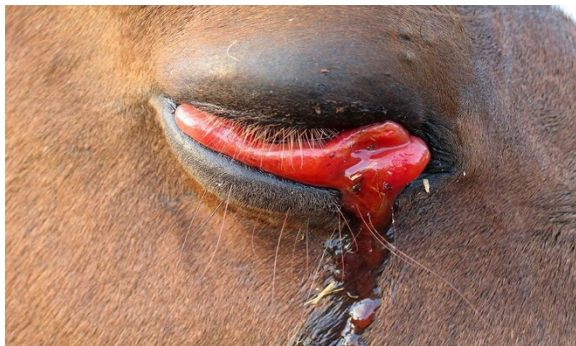
Figure 1 Horse suffering from petechial haemorrhage.

Horse sickness fever is the mildest form of the disease, during which, the animal will develop a moderate fever and some oedema of the supraorbital fossae (Figure 3).