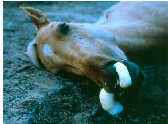
Figure 2 Horse suffering from severe respiratory distress.

There is no mortality associated with this form of the disease [13].