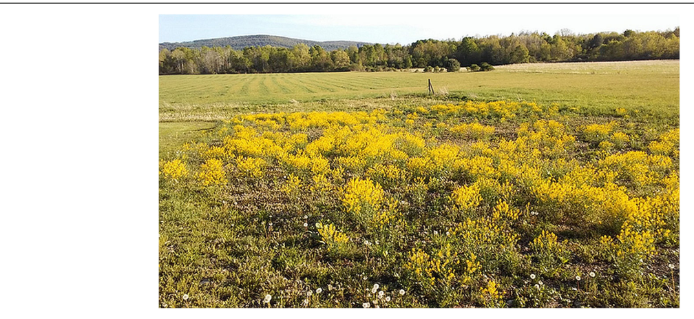
Fig. 2 Yellow Rocket, Barbarea vulgaris growing in Ithaca, NY, May 21th 2018

Mass Spectroscopy [LC/MS] data for the determination of Aminorex in Yellow Rocket administrations are shown in Fig. 4. The transition for Selected Ion Monitoring of Aminorex was 163.1 > 103.1. Panel A shows the chromatogram of the pre-administration urine, Panel B shows a 4-h urine