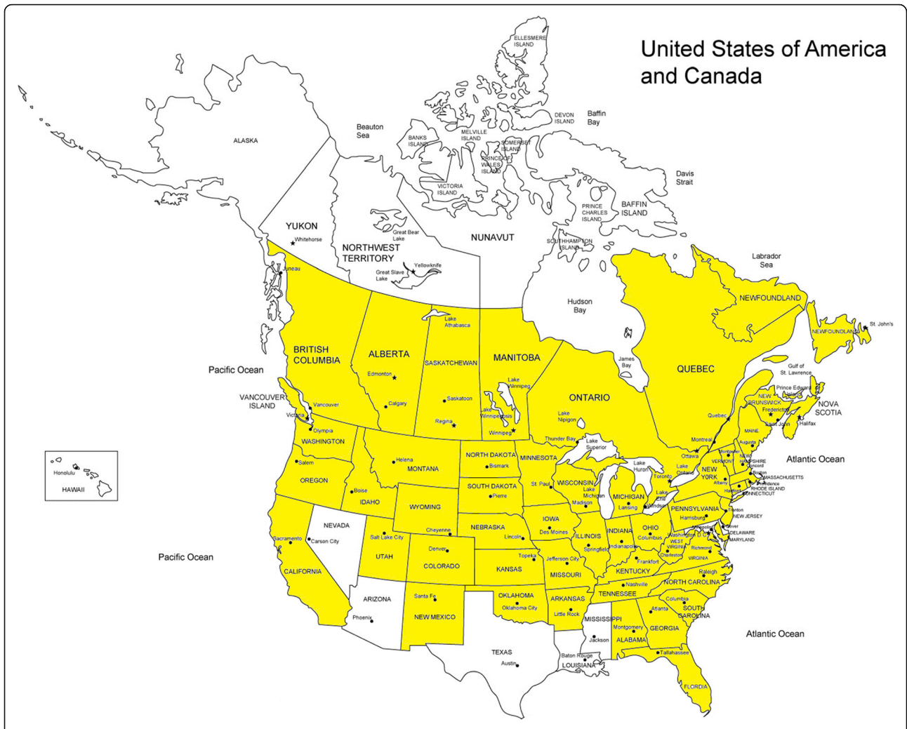
Fig. 5 Distribution of Yellow Rocket, Barbarea vulgaris , in the United States; Data re-constructed from USDA reports [13]. The British Isles show similar distribution, with only parts of Scotland having none reported as of May, 2019 ([14]

Maylin et al. Irish Veterinary Journal (2019) 72:15 Page 6 of 8