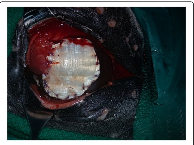
Fig. 6 Intraoperative photograph illustrating the fascia lata graft covering the ulcer

Seven days after the fascia lata graft was placed (Day 21 of hospitalization), the tarsorrhaphy was opened and the eye assessed. The graft was intact, and the horse seemed appreciably more comfortable showing only mild blepharospasm and epiphora. Fourteen days after the second graft (Day 28 of hospitalization), the fascia graft started to degrade while tissue repair was taking place over the corneal defect. The mare seemed comfortable with only mild blepharospasm and epiphora. Hence, the subpalpebral lavage system and the sutures from the donor site were removed, and the topical medications and flunixin meglumine were discontinued. Over the next 2 days, the graft continued to degrade and the eye remained comfortable (Fig. 7). On day 17 after the second surgery (Day 31 of hospitalization) the graft had completely sloughed off (Fig. 8) and the remaining sutures were removed. Ophthalmic examination demonstrated prominent superficial and deep peripheral corneal neovascularization extending to the grafted cornea and significant corneal scarring of the affected area with associated loss of transparency. The graft stained positively with