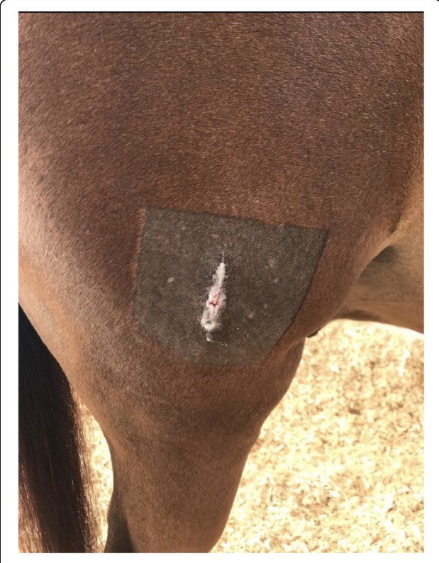
Fig. 5 Photograph illustrating the donor site after two weeks of healing in pony