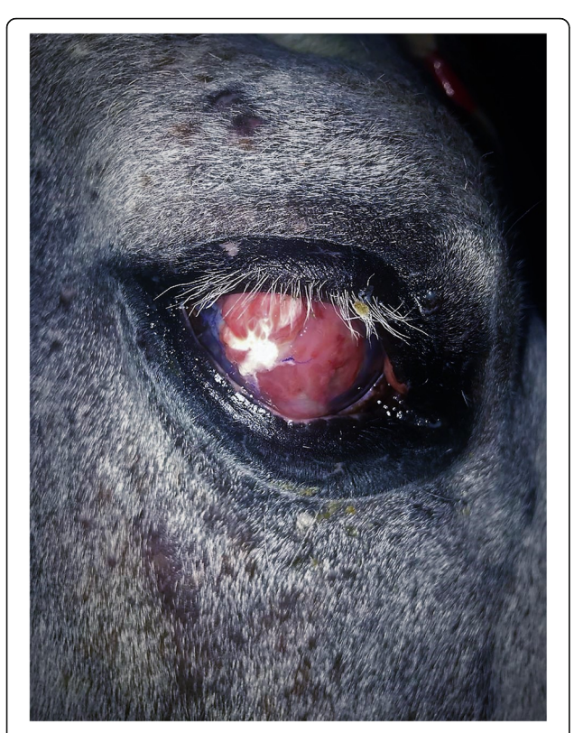
Fig. 8 Illustrates the appearance of the eye at the time of discharge from the Hospital, 31 days after arrival and 17 days after fascia lata grafting. The graft has almost completely sloughed and the eye globe is stable without any evidence of corneal perforation

Lores et al. Irish Veterinary Journal (2020) 73:7 Page 6 of 10