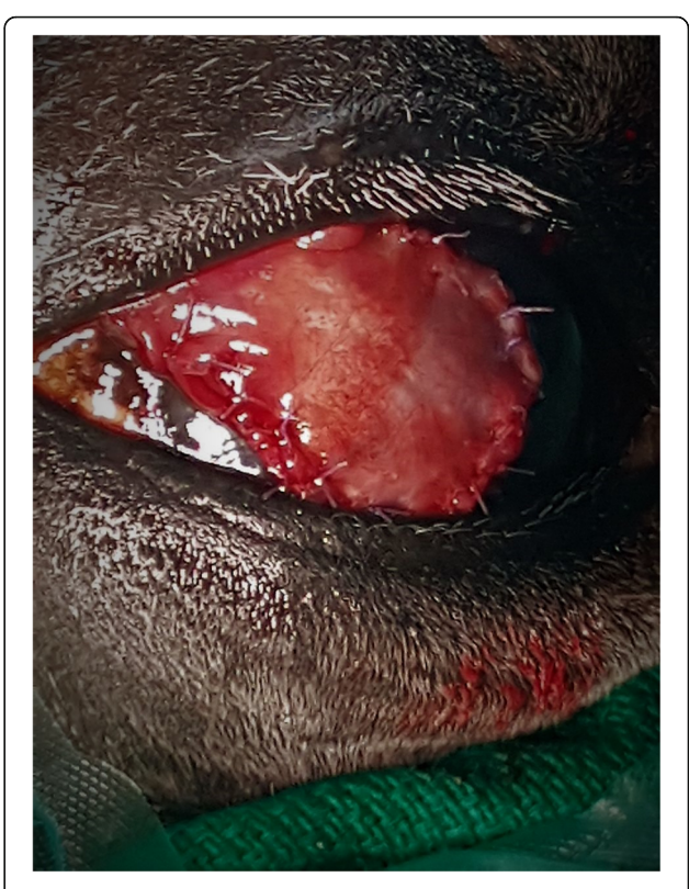
Fig. 2 Intraoperative photograph illustrating the pedicle conjunctival flap created to cover the ulcer

The horse remained hospitalized and the previous medical treatment was continued for a further week. On Day 7 post-surgery, the temporal tarsorrhaphy was opened and the eye assessed. The graft had partially dehisced to leave a large central portion of the diseased cornea exposed. The corneal ulcer had enlarged (90% of the cornea diameter was now involved) and liquefaction