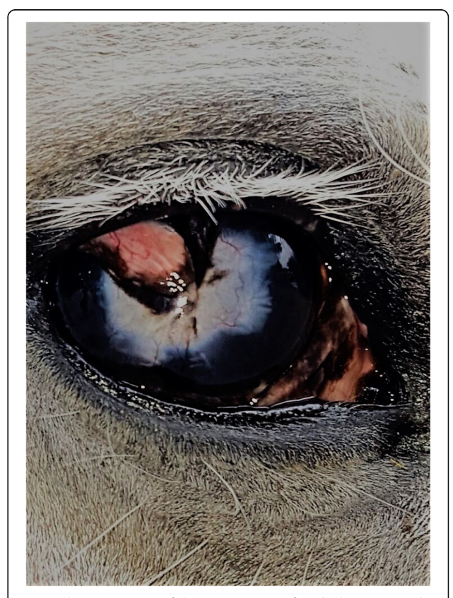
Fig. 9 The appearance of the eye one year after discharge. Note the central corneal fibrosis and the partially pigmented conjunctival flap that was left after dehiscence of the first conjunctival pedicle graft

This report documents a new technique for repair of complex defects of the equine cornea. Treatment of collagenolytic keratitis is either medical, surgical or both. Initial medical therapy for infectious keratitis has been routinely based on treatment of the cornea with topical antimicrobials, cycloplegics to dilate the pupil and reduce ciliary spasm, systemic anti-prostaglandin synthetase inhibitors for pain relief and anticollagenase medications all applied topically [2]. In cases of primary fungal keratitis, beside prophylactic antibiotic medication, medical therapy must be directed against the fungus and a topical, broad-spectrum, antifungal agent is appropriate while awaiting culture and sensitivity results. Topical voriconazole is an excellent first choice of