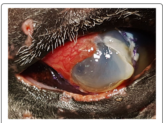
Fig. 3 Appearance of the eye 7 days after the conjunctival flap. Note the graft had partially dehisced, the progressive corneal stromal liquefaction, and the presence of a central lateral focal descemetocele (bulging Descemet's membrane)

(melting) was present with approximately 85% of corneal stroma loss, and a central lateral focal descemetocele of 5 mm diameter (Fig. 3). At this point, due to impending corneal perforation, enucleation or a second ocular surface reconstruction procedure was recommended with the sole purpose of preserving globe integrity. The owner declined enucleation, and a second grafting