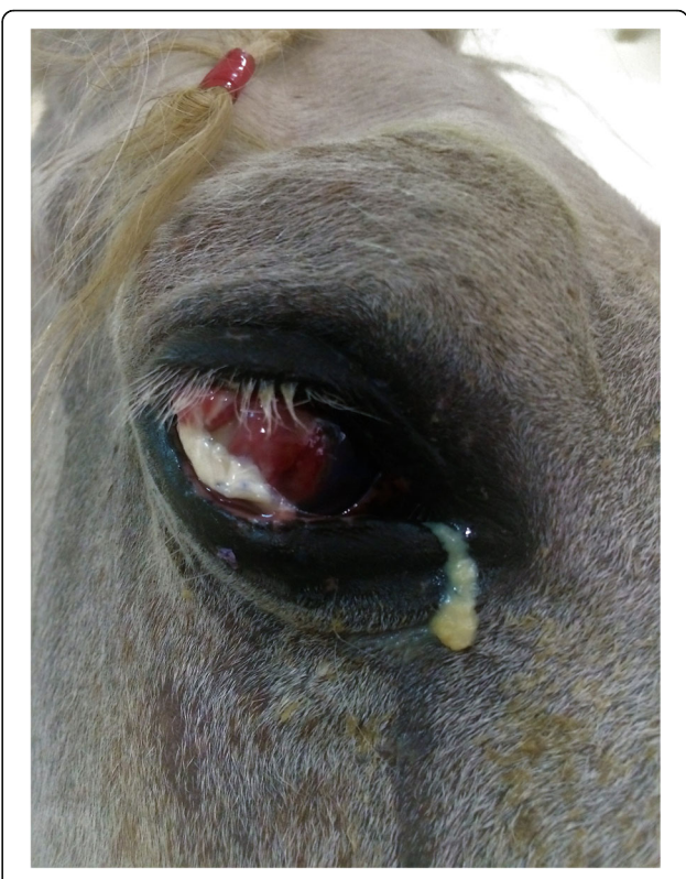
Fig. 7 Illustrates the eye's appearance 30 days after hospitalization (i.e. 16 days after corneal grafting). The fascial graft was degrading as a result of autolysis

fluorescein and the horse showed normal menace responses and dazzle reflex in just the temporal aspect of the eye. The presence of consensual and direct pupillary light responses in the injured eye were detected only via a limited view of the anterior chamber from the temporal aspect of the eye since no other corneal quadrants were accessible due to scarring. Similarly, only partial assessment of the anterior chamber was possible from the temporal aspect of the eye which revealed a mild inflammation with moderate flare. The posterior segment of the eye could not be examined due to corneal opacity. A Schirmer tear test was within normal limits [13] and no significant intraocular abnormalities were evident ultrasonographically [15]. The fascia donor site was also healing without complications. At this time, the horse was discharge with omeprazole as the only medication prescribed.