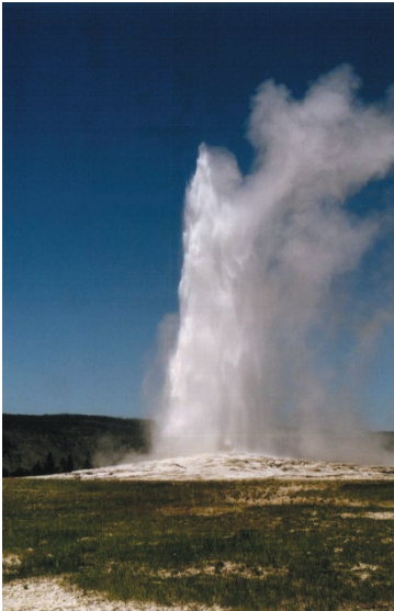
Old Faithful in Yellowstone National Park, Wyoming, USA, where Taq DNA polymerase was first discovered.