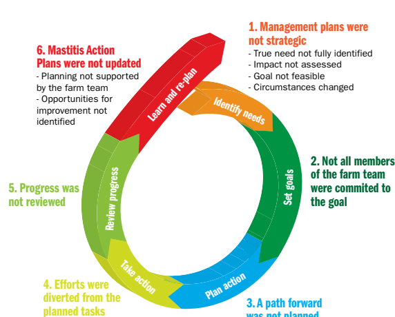
Figure 3: Stalling points, and potential reasons for stalling, on the action planning cycle (Nettle et al. 2006).