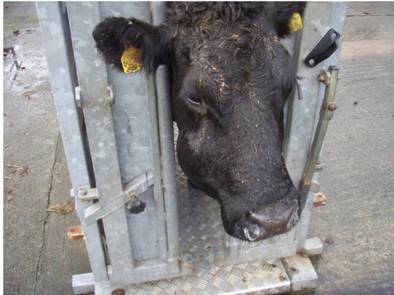
Figure 1 Unilateral facial swelling in a 10-year-old Limousin cross cow.

concentrations were slightly elevated; the albumin/globulin ratio was decreased. No abnormal findings were reported on bacteriology and parasitology of a faecal sample. Bovine virus diarrhoea (BVD) antibody detection was positive but virus detection was negative. Johne's disease serology was negative.