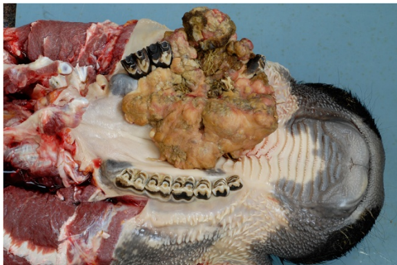
Figure 2 Oral mass protruding from the right maxilla.

Culturing of samples taken from the mucopurulent nasal discharge isolated the following bacteria and fungi: Trueperella ( Arcanobacterium pyogenes ), Pseudomonas aeruginosa , Staphylococcus epidermidis , Streptococcus spp. , and Candida spp. A small superficial section (1 × 1 cm) of the mass was removed for bacteriological and histopathological examination. Culture results of the mass indicated sparse cultures of Streptococcus spp. , Staphylococcus epidermidis and Weeksiella virosa . Histological results showed infiltration of fibrous tissue with inflammatory cells, many of which contained bacteria. No signs resembling Actinomyces bovis were found, sulphur granules were not observed. Neoplastic cells were also not observed in this initial tissue sample.